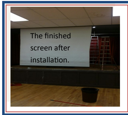
The finished screen after installation.

In between shoveling snow and plowing streets, these hardworking and talented crew members are working hard on getting the aquatic center ready for the 2019 summer season. Renovations include fresh paint as well as many other projects to improve the aquatic center. Season will open on June 8, 2019.