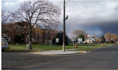
South Main Street Improvements