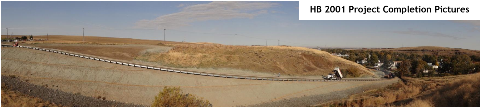
South Main & Key Boulevard Extension