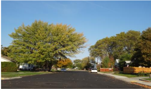
S. Mill Street Widening Improvements