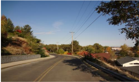
College Street Pedestrian Improvements